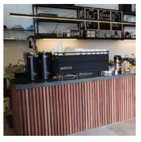
Enclose a bench to create a counter.

Brisbane • Sydney • Melbourne • Hobart • Adelaide • Perth • Auckland For more info please contact your nearest Brayco Branch 1300 272 926 | brayco.com.au